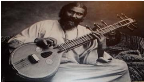
Sufi Inayat Khan

During a recent visit to the Gujarat State Waqf Board, Gandhinagar, its Officials and National Project Coordinator (WAMSI) visited few Waqf Properties in & around Twin Cities of Gandhinagar and Ahmedabad to get GPS Coordinates to show the Proof of Concept and to transfer the knowledge to local SWB Staff for WAMSI GIS Interfaces. This visit was extended to Vadodara (earlier known as Baroda) and found very interesting Waqf Estate called Universal Sufi Trust, Vadodara (Sufi Inayat Khan Waqf) whose Waqf ID is GJ060021 and Prop.ID is BLO02 .