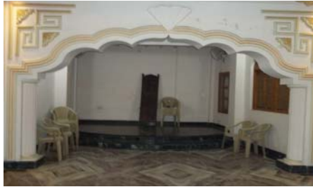
Sufi Inayat Khan birth place, now used for his Music Festivals